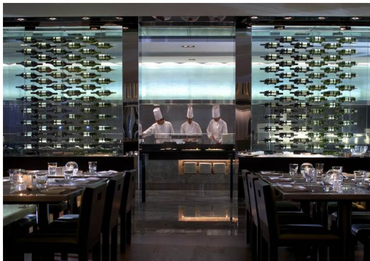
Chefs at Yamm