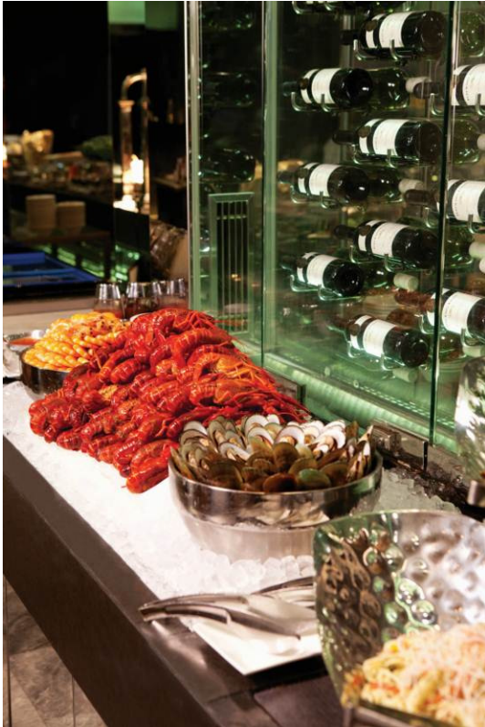
Yamm's jet-fresh seafood buffet