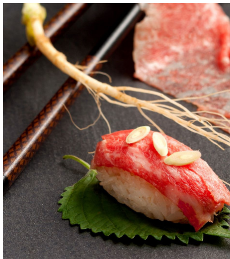
Melt in your mouth marbled Wagyu Beef Sushi