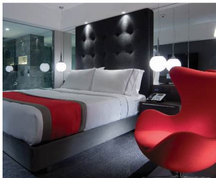
Designer Interiors - City Room at The Mira