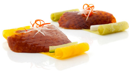
Roasted Peking Duck at Cuisine Cuisine

The Mira Hong Kong is a smoke-free, design-driven urban retreat with 492 boldly accented guest rooms, including a collection of 56 suites and specialty suites. Overlooking the lush Kowloon Park and centrally located in Tsimshatsui, the heart of Hong Kong's commercial, shopping, dining and entertainment district, the hotel easily connects guests to all parts of the vibrant metropolis being a short walk from MTR stations and the Star Ferry. The Mira Hong Kong is a member of Design Hotels™. www.themirahotel.com