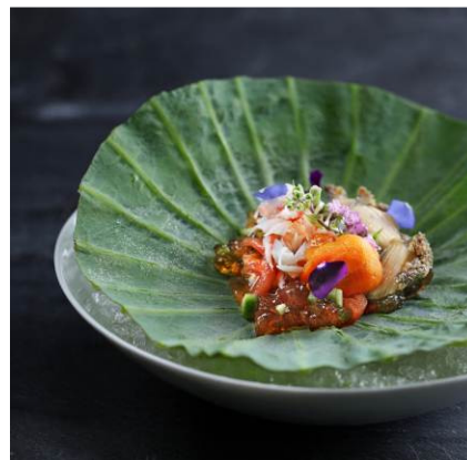
WHISK Omakase Dinner