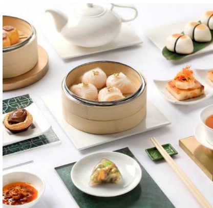
All You Can Dim Sum Lunch at Cuisine Cuisine