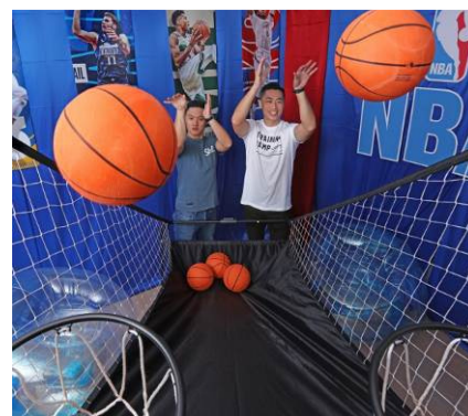
Complimentary Access to Mirathon Floor of Activities for In-house Guests