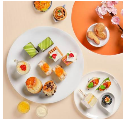
Afternoon Tea Set at COCO