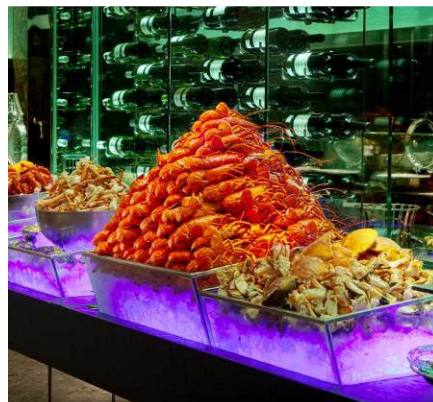
Seafood Tower at Dinner Buffet at Yamm