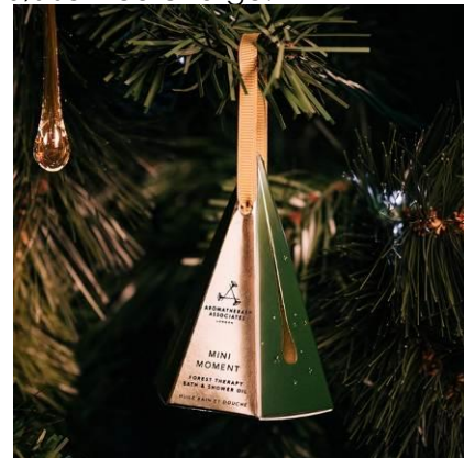
Spoil your friends this festive season by giving them miraculous gifts from MiraSpa

Or share the joy of well-being with your loved ones and surprise them with gorgeously scented spa goodies from the beloved UK brand Aromatherapy Associates and Five Senses