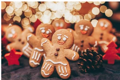
Gingerbread man classes available from December 18 to 26 for all in-house guests

Ignite the lights of festivity with all that excitement and entertainment. All hotel guests may take advantage of the Gingerbread man classes available from December 18 to 26 during their stay at the design haven under the watchful eye of talented pastry chefs.