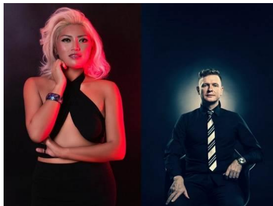
80s Disco Legends is the dress code and party theme for the Party with 2 live DJs