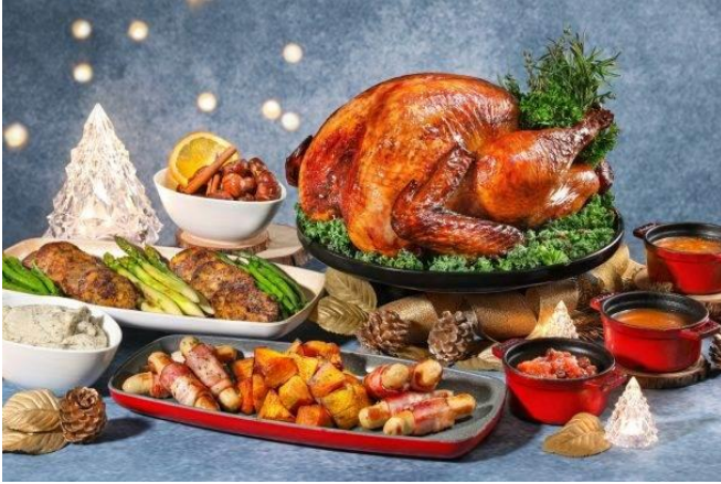
Golden Roasted X'mas Turkey Set from The Mira comes with all the trimmings