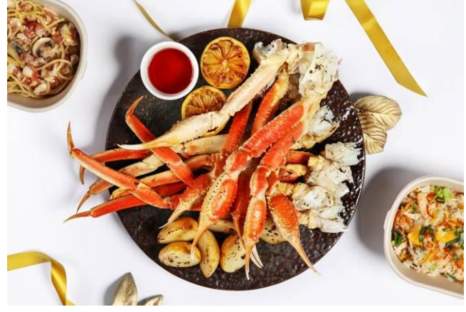
Festival Food Box Take-away Set from Yamm features deluxe seafood

For those who crave for a feast at home – why not order Yamm's Feast@Home Food Box , a choice of 2 sets of Western & Asian signature specials from HK$3,088 for 6 Guests, all ready to be served on your family table!