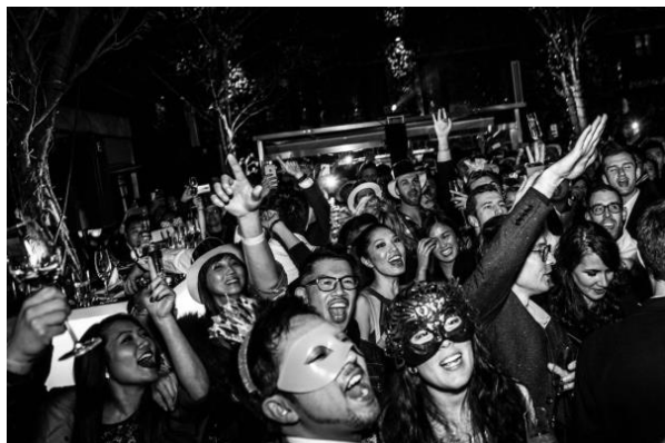
Countdown Party under the stars at Vibes gathers notoriously well-heeled crowd

If you love the nightlife, if you live to boogie, you won't miss the Disco DeLights Countdown Party at Vibes, Hong Kong's premier open-air lounge bar featuring running waterways, live fires, lush greenery and comfy cabanas – the perfect laid-back setting for a fun-luvin' crowd! A mirrored disco ball , smoke effects , confetti guns , and a riot of colours provide the perfect backdrop to toast to a better year to come with champagne and unlimited cocktails surrounded by the nearest and dearest souls at your table! Pro dancers and 2 live DJs, Gie and DJ Patrice Escalante will keep you on the dance floor all night long! Make sure to grab the early bird tickets on pre-sale until 28 December!