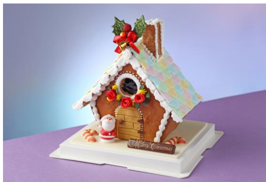
Mini Gingerbread House with candy and frosting