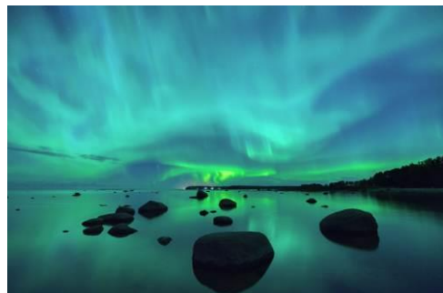
Win a holiday of your lifetime to see the sea the Northern Lights live