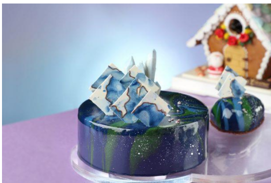
Dreamy Aurora Cake with a whimsical chocolate glaze

Send your wishes with original chocolate creations and traditional pastries that are a must on every Christmas table! Hand-crafted by COCO pastry elves, this season's collection features dreamy Aurora Cake (HK$398) with a whimsical chocolate glaze available in large and small size as well as homemade Italian Panettone, German X'mas Stollen, and a playful Gingerbread House!