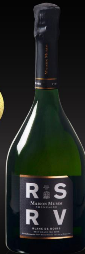
Mumm, RSRV Grand Cru Blanc de Noirs Brut 2014 $1,380 per bottle

miraplus+ members enjoy nett price. Prices are subject to 10% service charge.