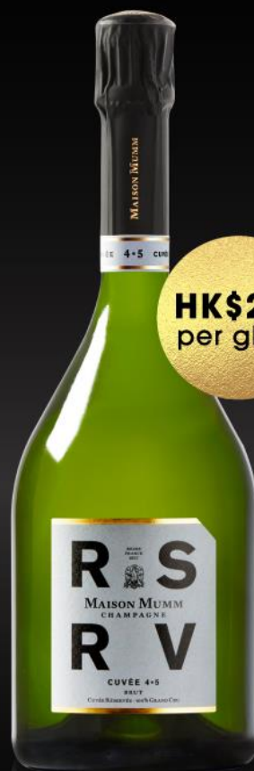
Mumm, RSRV Cuvée 4.5 Grand Cru Brut NV $980 per bottle