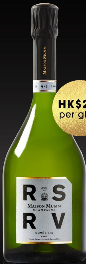
Mumm, RSRV Cuvée 4.5 Grand Cru Brut NV $980 per bottle