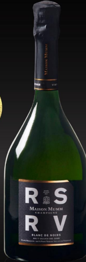
Mumm, RSRV Grand Cru Blanc de Noirs Brut 2014 $1,380 per bottle