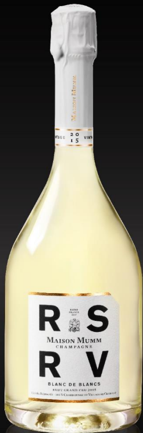
Mumm, RSRV Blanc de Blancs 2015 $1,380 per bottle