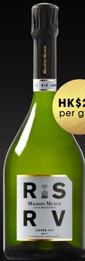
Mumm, RSRV Cuvée 4.5 Grand Cru Brut NV $980 per bottle